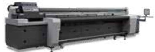
R126H / Z126H*