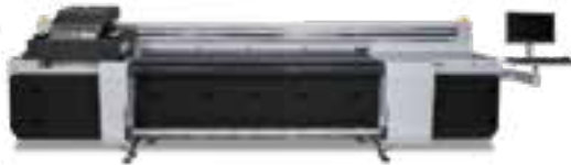
R98H / Z98H