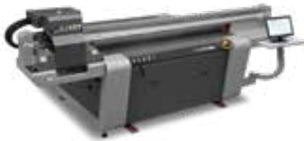
R53F / Z53F