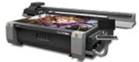
R105F / Z105F*