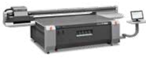
R84F / Z84F*