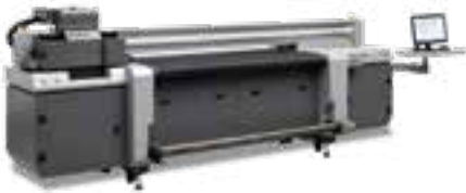
R63H / Z63H